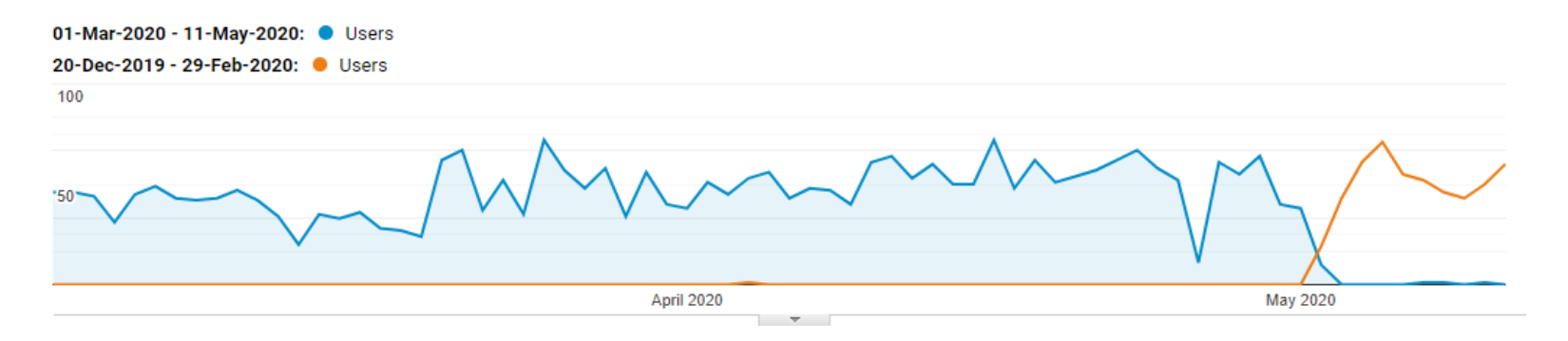
Figure 1: Organic traffic for Ancient Hair Secrets from March-May 2020

Our reports show a substantial increase in organic website traffic between February 2020 and May 2020, as shown in Figure 1. Where initially the website only received 478 visitors, now it had climbed up to a whopping figure of 2,619 visitors!